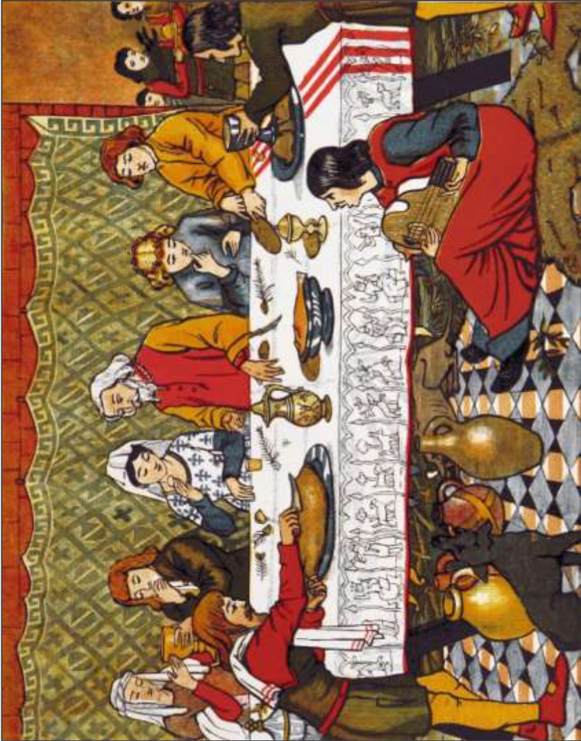
Dinner in the Olden Times