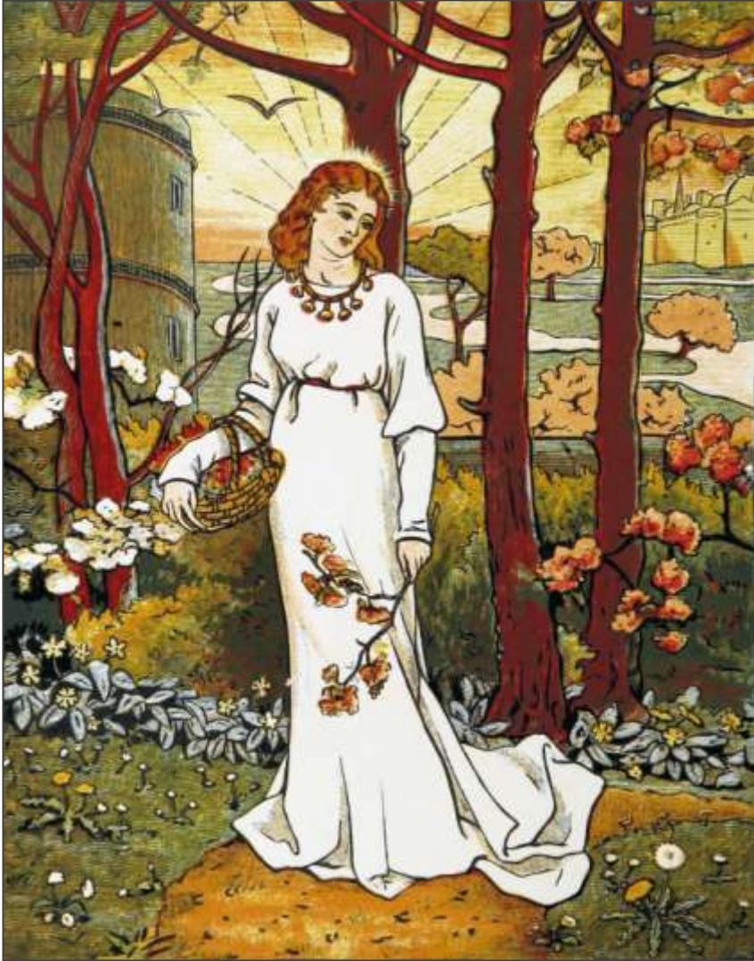
Fair Emily Gathering Flowers