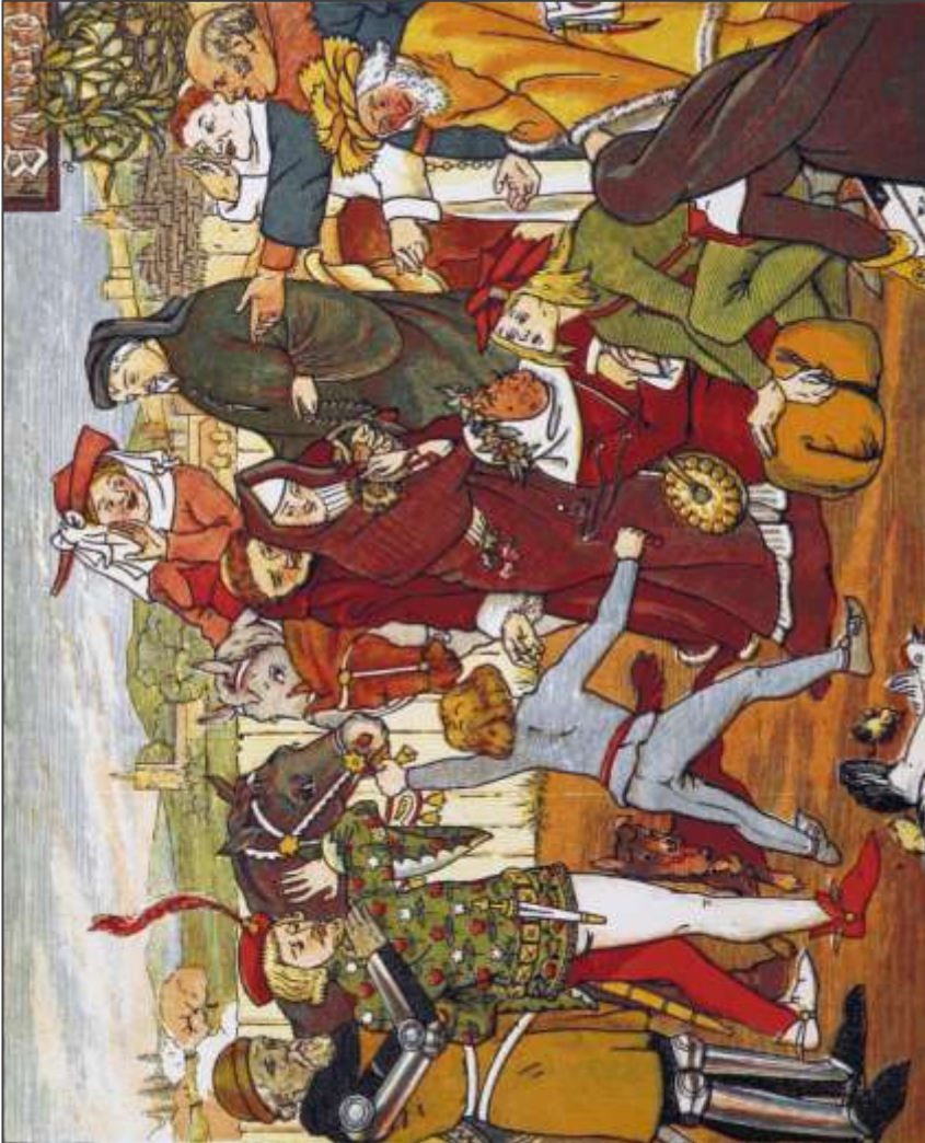
Assembling the Canterbury Pilgrims