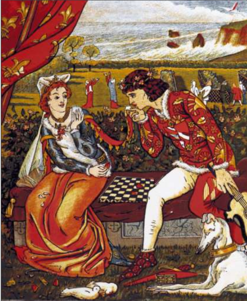
Dorigen and Aurelius